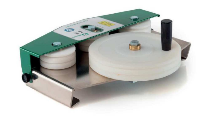
PROFLEX MACHINE - hand machine to bend proflex line profiles