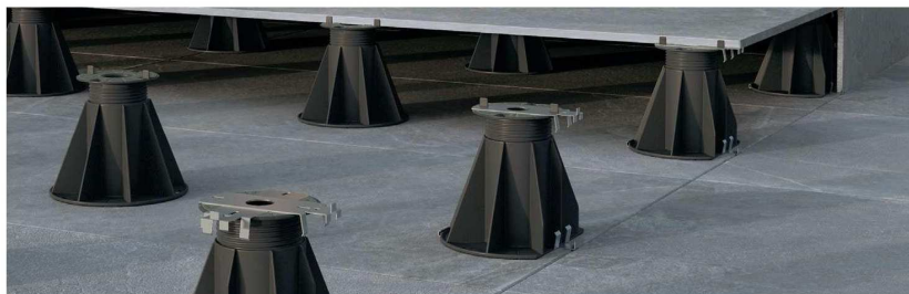
PCC/01 and PCC/02 stainless steel clips