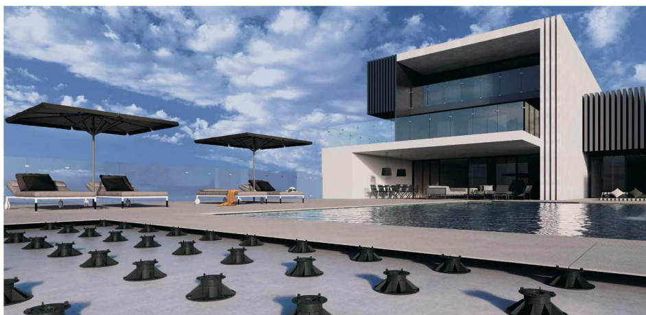
PP Level Fix