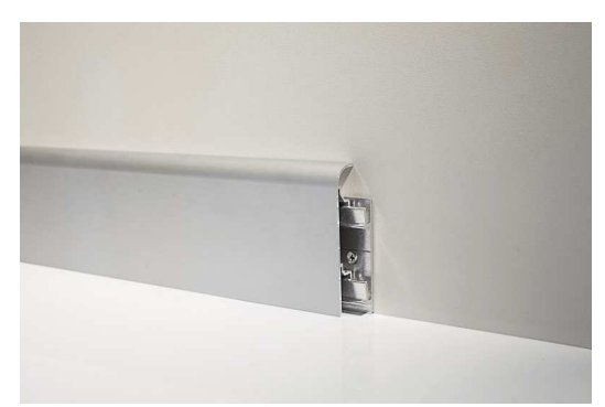
97/ 7 with base S/95