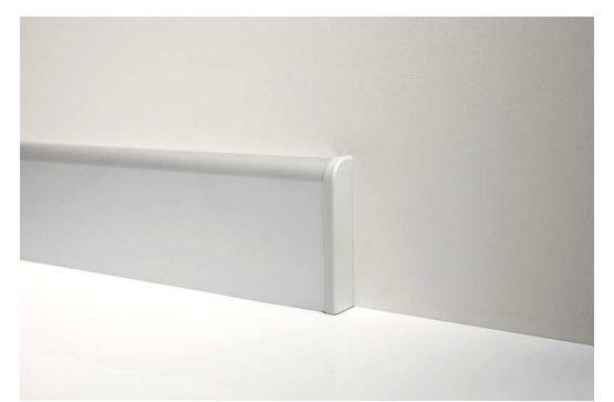
right end cap