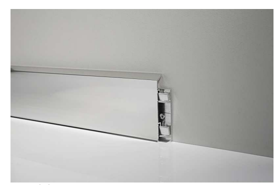
95 with base S/95