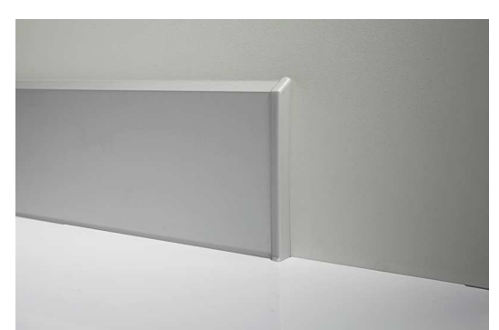
right end cap